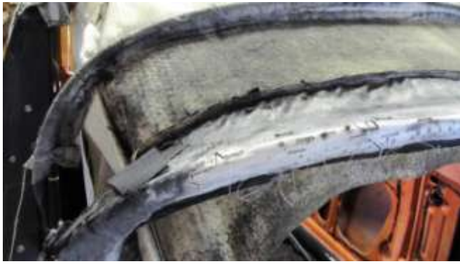
538. View of how liner is attached to frame.