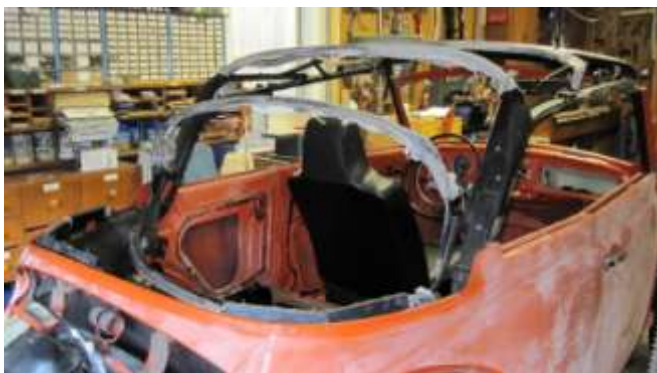
541. Top with everything removed but frame and outer quarter facing.