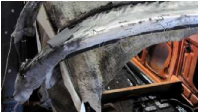
539. View of how liner is attached to frame.