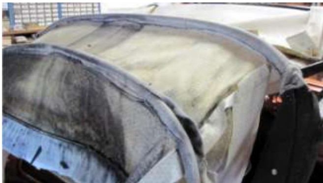
540. View of how liner is attached to frame.