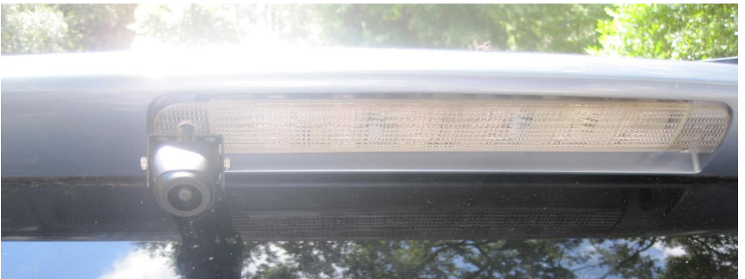
7. Camera Installed with existing Light Screw.