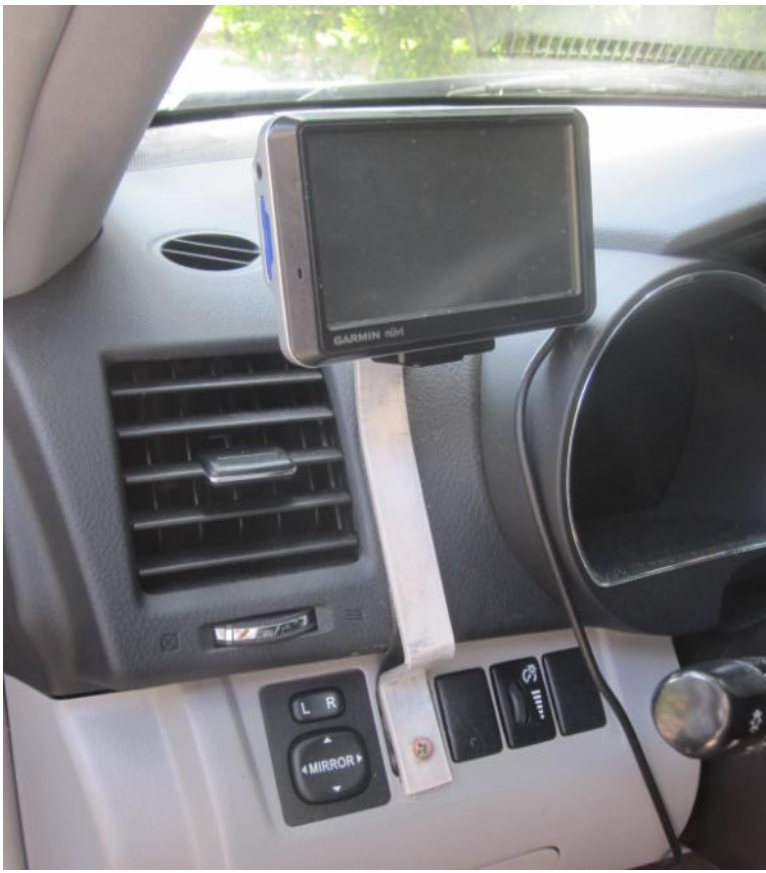
1. Old 5" GPS Unit