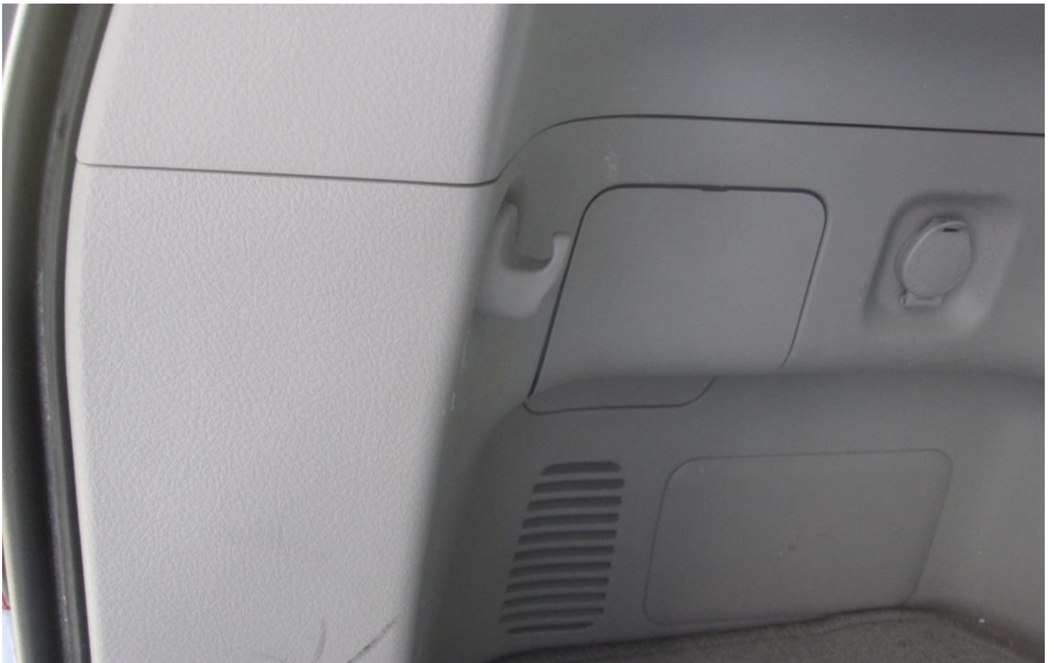
10. Wire located behind panel to Back-up light access hole.