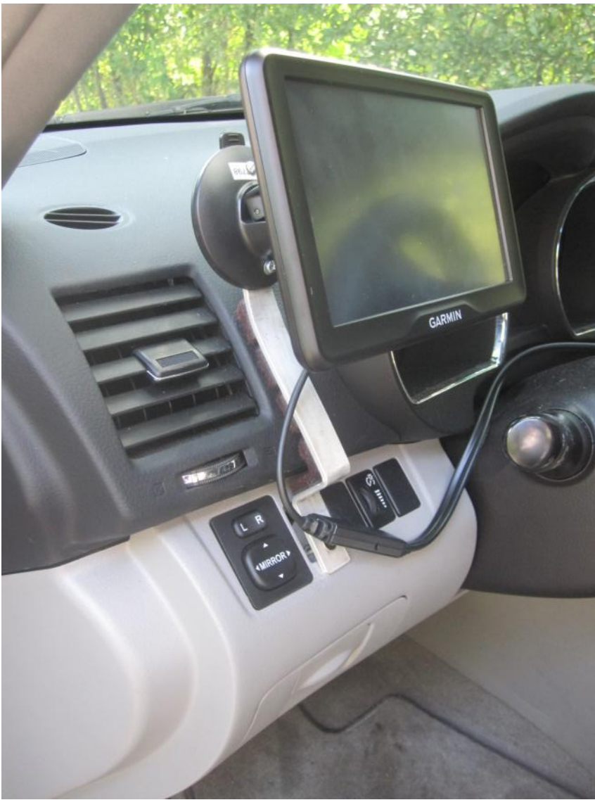
3. New 7" GPS with Back-up Camera mounted on same bracket.