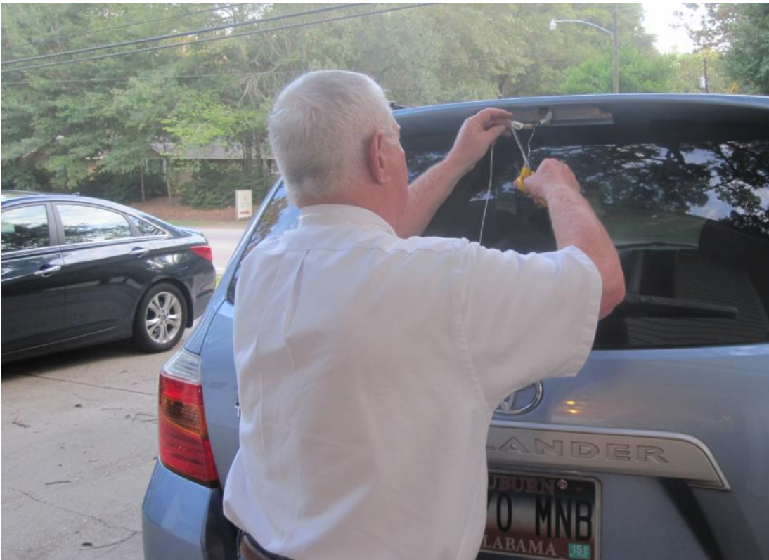
4. Push pull wire through existing light bracket hole.