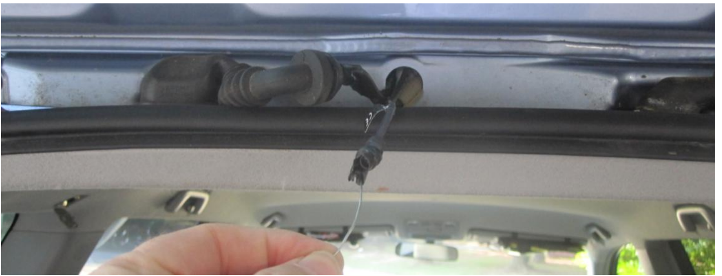
5. Pull wire through existing lower hole in deck lid.