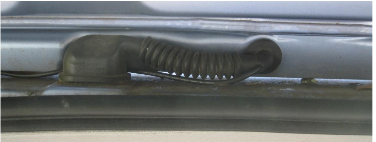
6. Wire shown exiting deck lid.