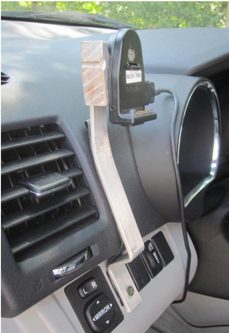
2. Old 5" GPS Unit Mount