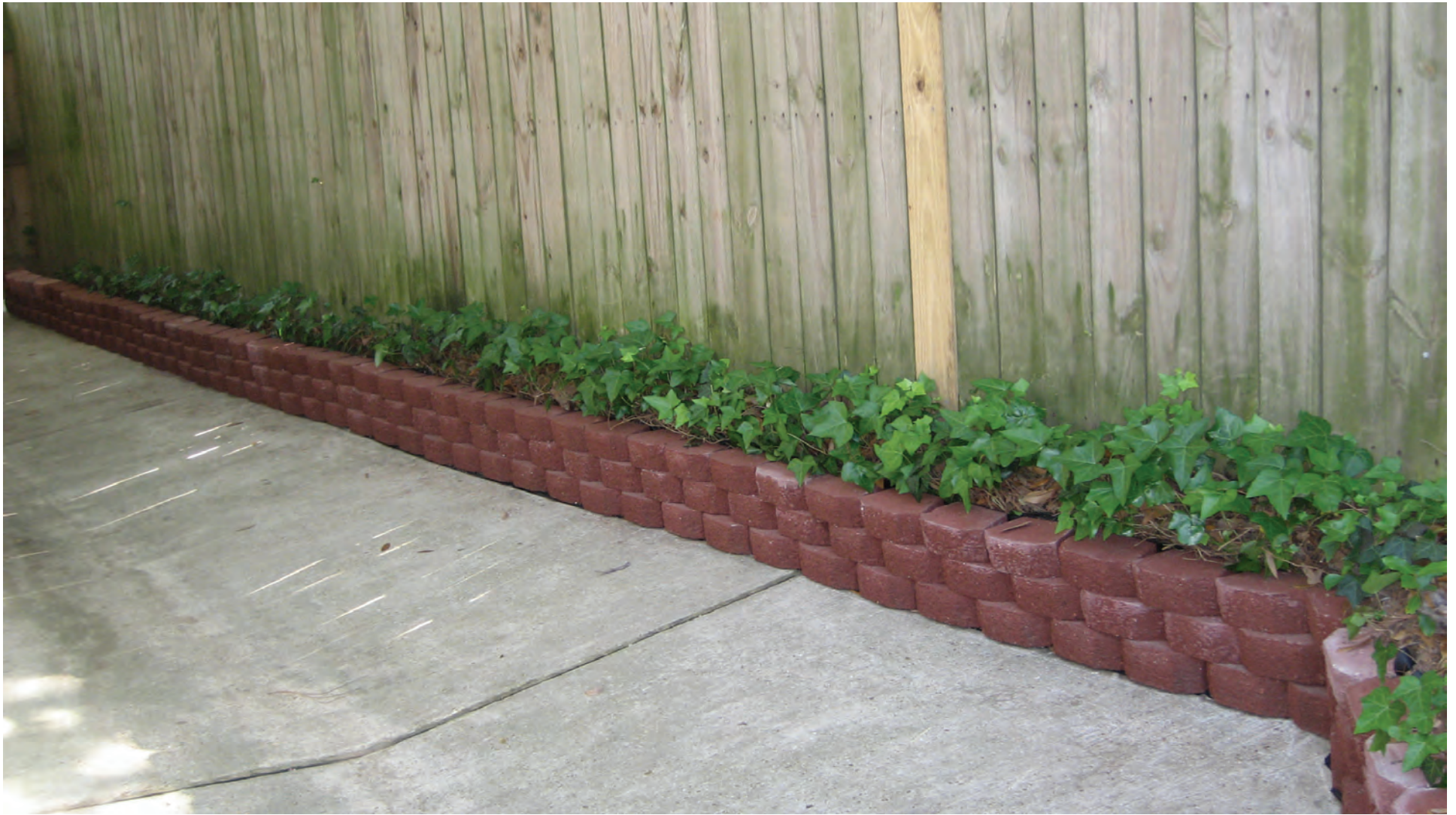
Retaining Wall, By Malcolm Beasley, 4-2008